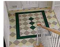
Miscellaneous material- such as floor tile