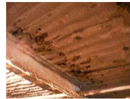
Surfacing materials- such as fireproofing, plaster

Since asbestos was used in numerous materials, it may be found in many common building materials: