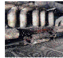
Thermal system insulation- such as pipe wrap